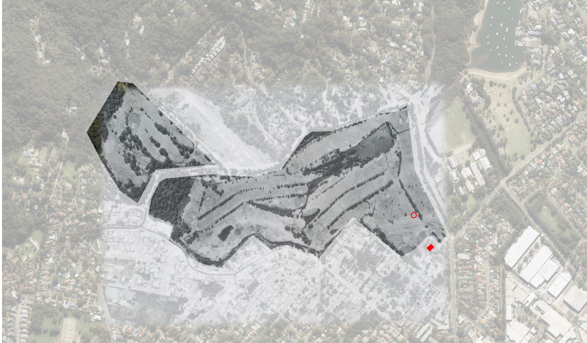
Figure 6 : 1942 Aerial overlay showing current location of the statues circled red, and the approximate location of the former Orr's House (since demolished) shown as a red box. The elephants statues original location fronted the Orr's house overlooking the golf course (as seen in figures 4 and 5 above).