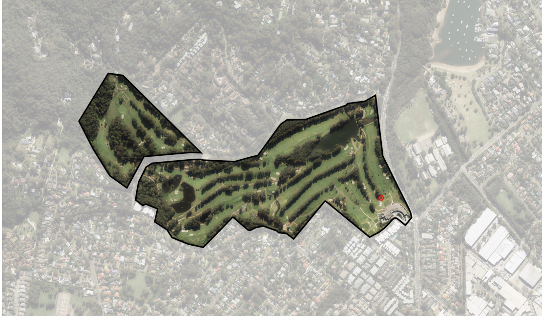
Figure 1 : Current location of heritage listed elephants within the Bayview Golf Course site (circled red).