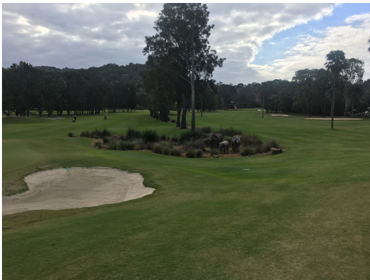
Figure 7 : View north showing current location within the Bayview Golf Course.