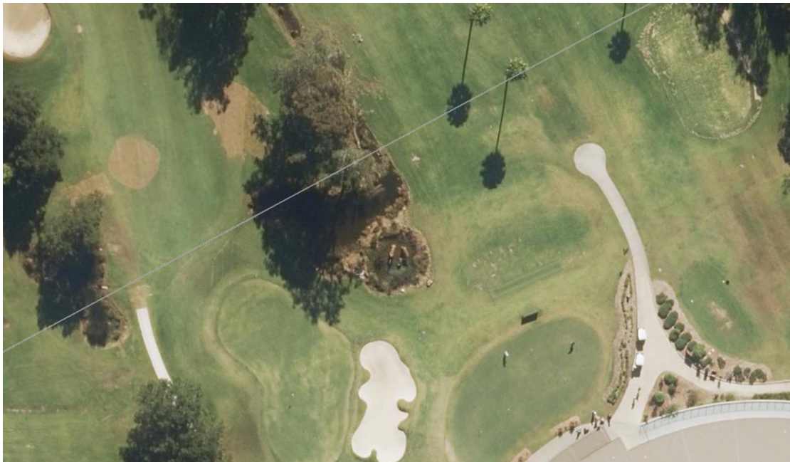
Figure 2 : Close up view of current location of heritage listed elephants within the Bayview Golf Course site.