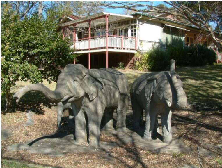
Figure 4 : Original location of concrete elephant statues at 1825A Pittwater Road, Bayview

With the demolition of the Orr's house and the old clubhouse, the group of three elephant sculptures are the only remnants of the early phase of the Bayview Golf Course. They have recently been installed on the 18th green.