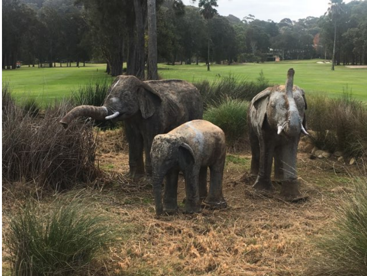
Figure 8 : Close up of their current location within the Bayview Golf Course. Note the change in composition of the three statues.