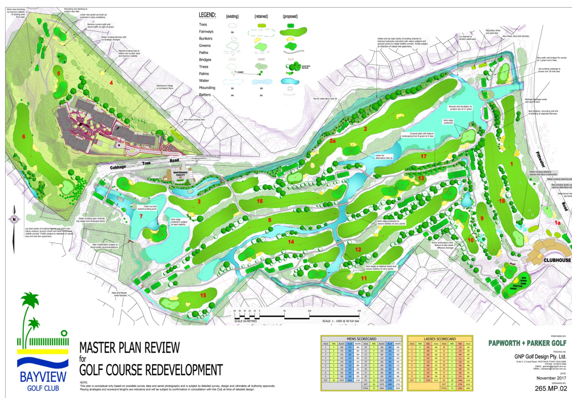
Figure 9 : Masterplan Review for Bayview Golf Course Redevelopment prepared by Papworth + Parker Golf

The statues are not affected by the works and remain within the setting of the gold course.