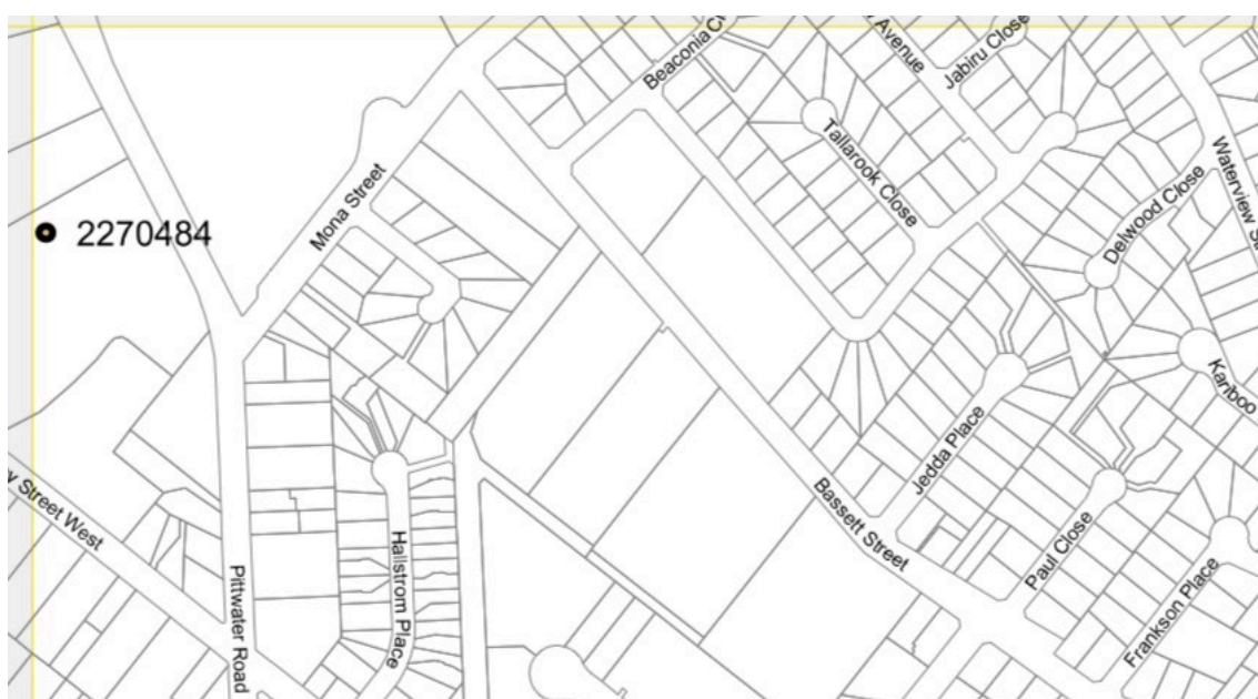
Figure 3 : Extract of Pittwater Local Environmental Plan 2014 Heritage Map - Sheet HER_018, showing the Heritage listed statues (item no 2270484)